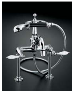
FINIAL TRADITIONAL BATH FAUCET WITH HANDSHOWER shown in chrome finish. $1,084–$1,736. Kohler; 800-456-4537, kohler.com .