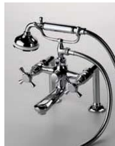
BEACON EXPOSED TUB MIXER WITH HANDSHOWER shown in nickel finish. $735–$1,250. Waterworks; 800-899-6757, waterworks.com .