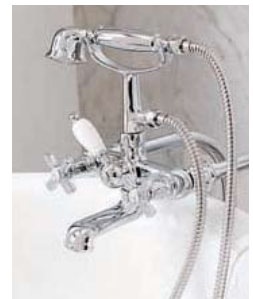
PALACE BATH FILLER shown in polished chrome finish. $550–$715. Porcher; 866-455-6118, porcher-us.com .